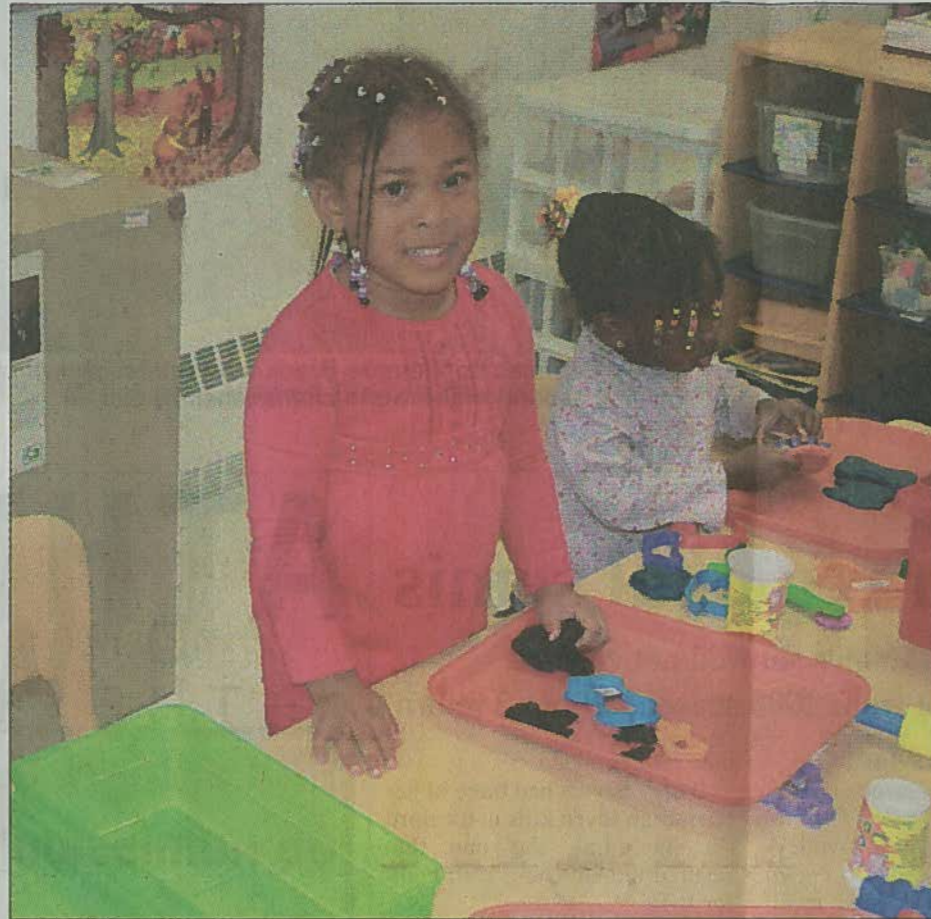
Two children play at the Head Start center.